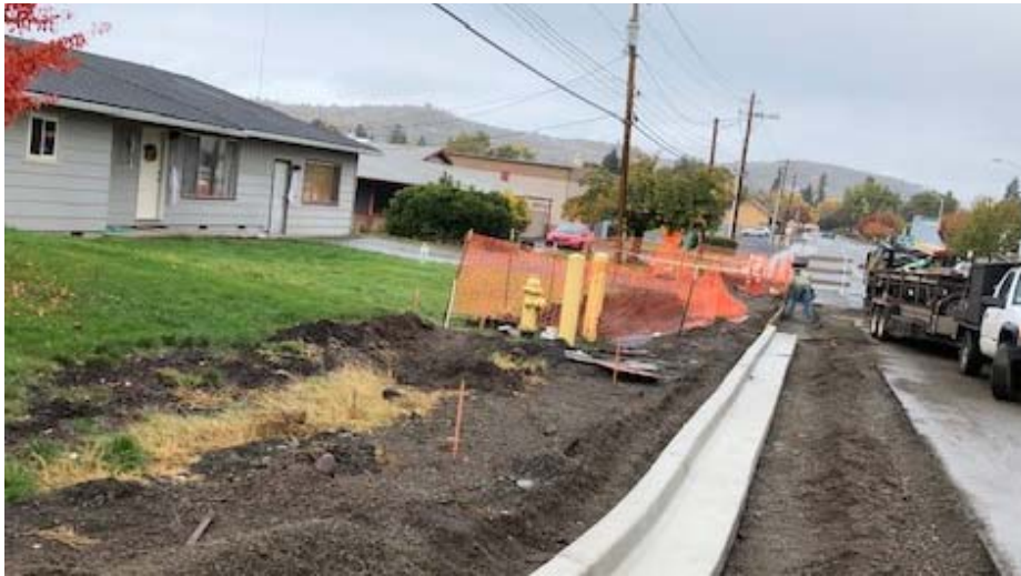
Water quality planter construction.