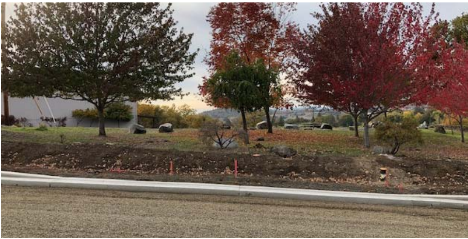
The driveway to the Church on the Hill will be relocated with the project.