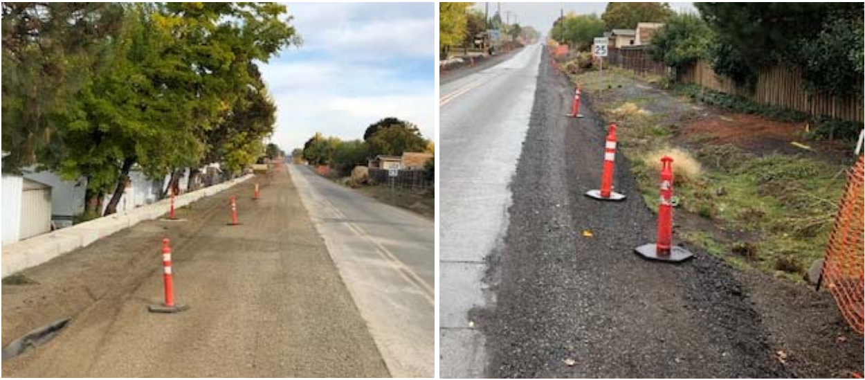
Widening for Stage 2 continued (Idlewood Drive to Bridgeport Drive).