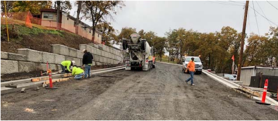
Drainage inlets were installed to prepare for paving.