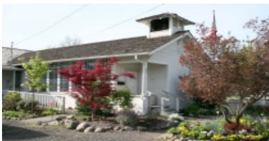
Eagle Point Museum: Friday—Sunday 11 a.m. - 4 p.m.

This series is made possible in part by the Institute of Museum and Library Services through the Library Services and Technology Act, administered by the State Library of Oregon.