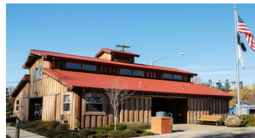
Harnish Wayside Park & Visitor Center: Friday—Sunday 11 a.m. - 4 p.m.