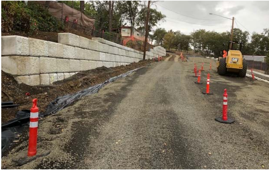
Excavation and placement of the new base for E. Main Street/Stevens Road.