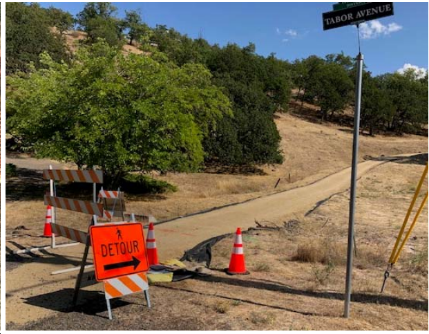
Onyx Road temporary pedestrian detour.