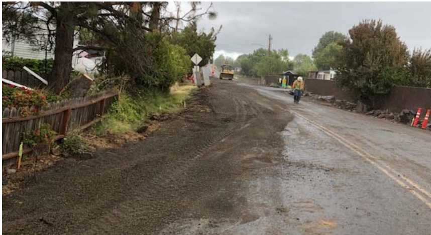
Construction of the Phase 2 storm system began. Phase 2 extends from Idlewood Drive to Robert Trent Jones Boulevard.