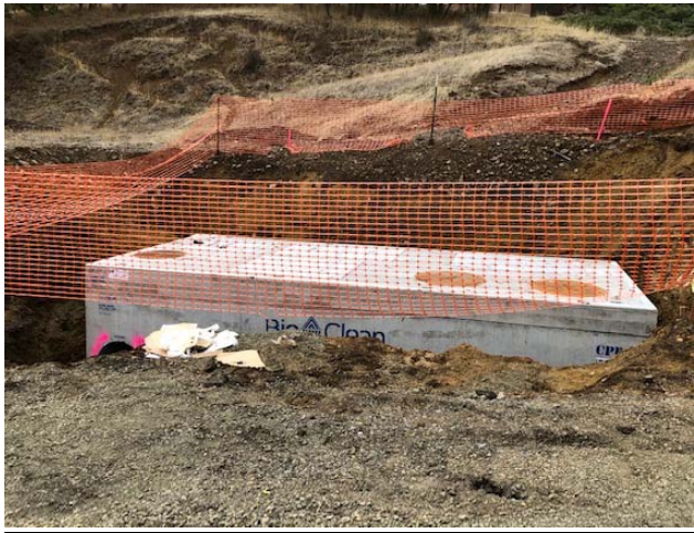
Water quality structure.