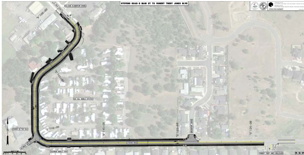
Limits of Project Construction